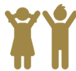
Schools and Kindergartens