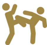
Martial arts and Combat